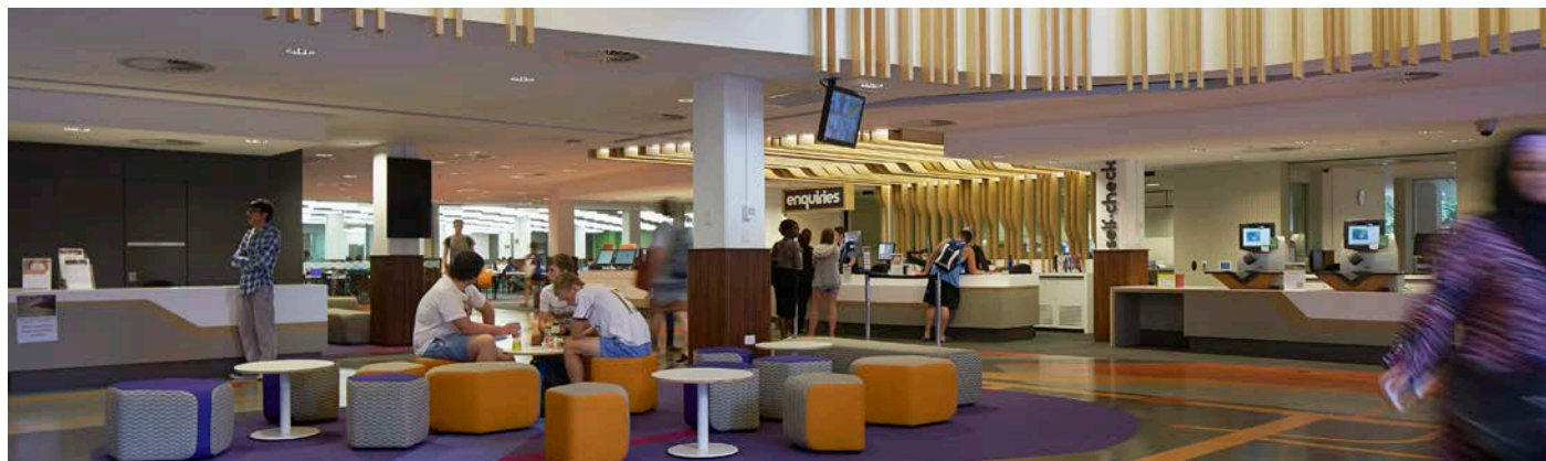
TL Robertson Library, Bentley Campus

Curtin's Western Australian libraries co-operate with libraries at Curtin's Sydney, Sarawak and Singapore campuses and Curtin's offshore partners to provide a full range of library resources and services.