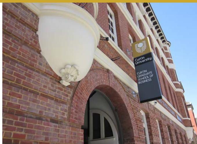
Curtin Graduate School of Business, Perth