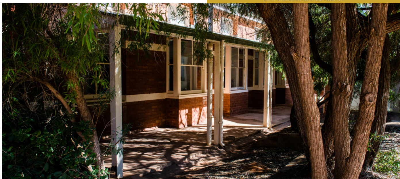
WA School of Mines Library, Kalgoorlie