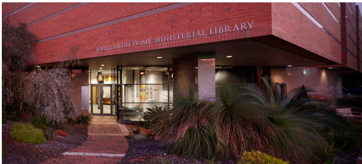
John Curtin Prime Ministerial Library, Bentley Campus